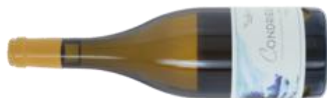
2019 CONDRIEU Domaine Pierre Gaillard