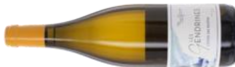
2019 VIOGNIER Les Gendrines Côtes du Rhône Domaine Pierre Gaillard